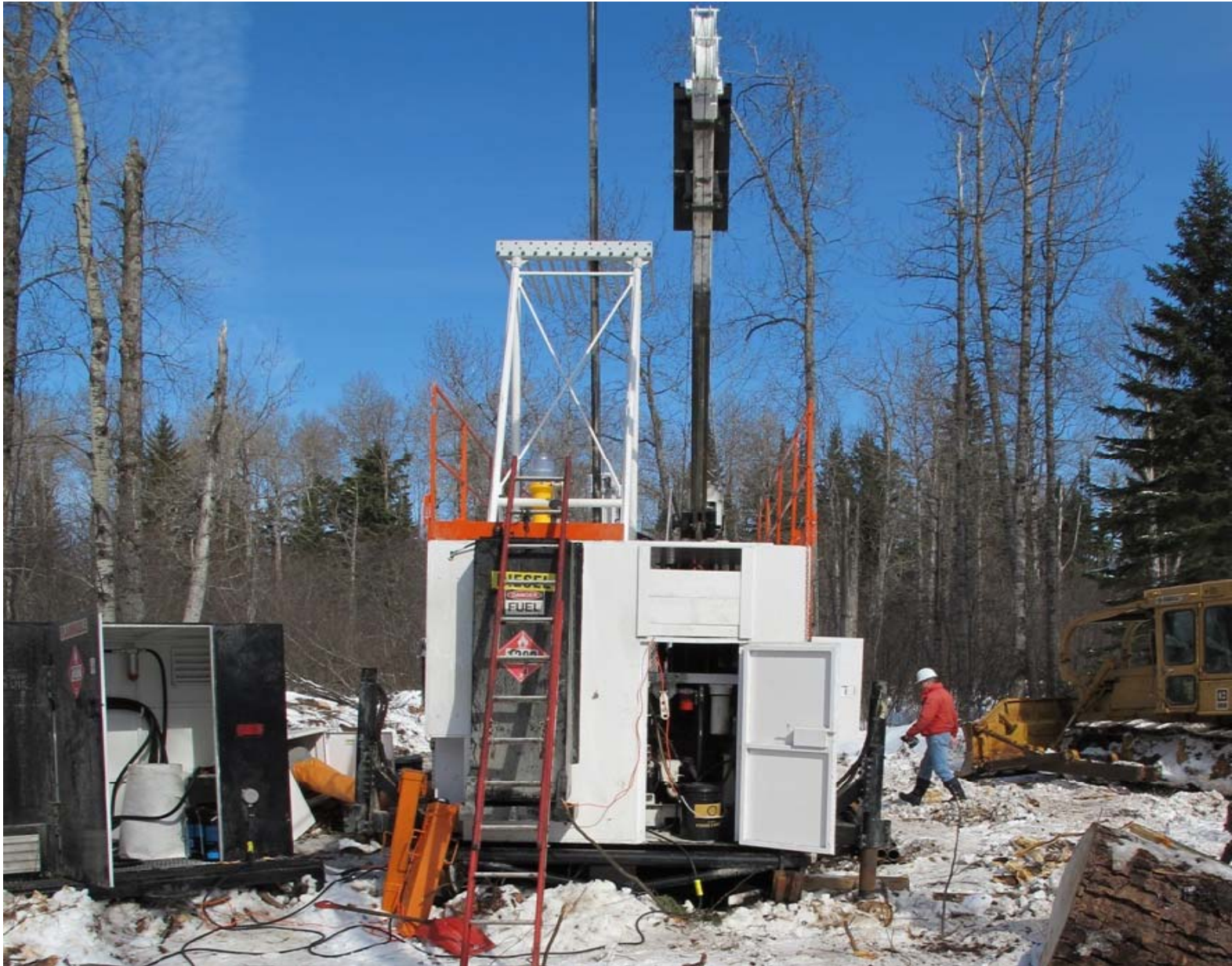
April 2010 Geomark Drilling Program – Carr Wilkie, Timmins